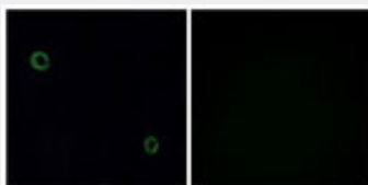
Immunofluorescence of A549 cells, using CXCR4 Antibody.